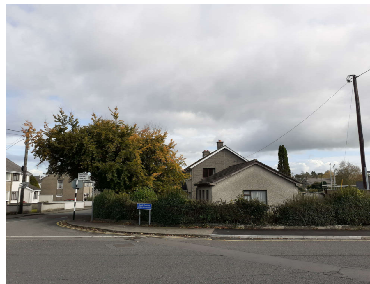
IMAGE 2. VIEW FROM KILLCULLEN ROAD R448