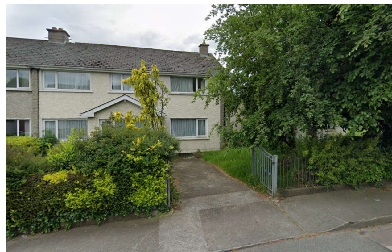
IMAGE 1. VIEW FROM PATRICIAN AVENUE-FRONT OF EXISTING HOUSE