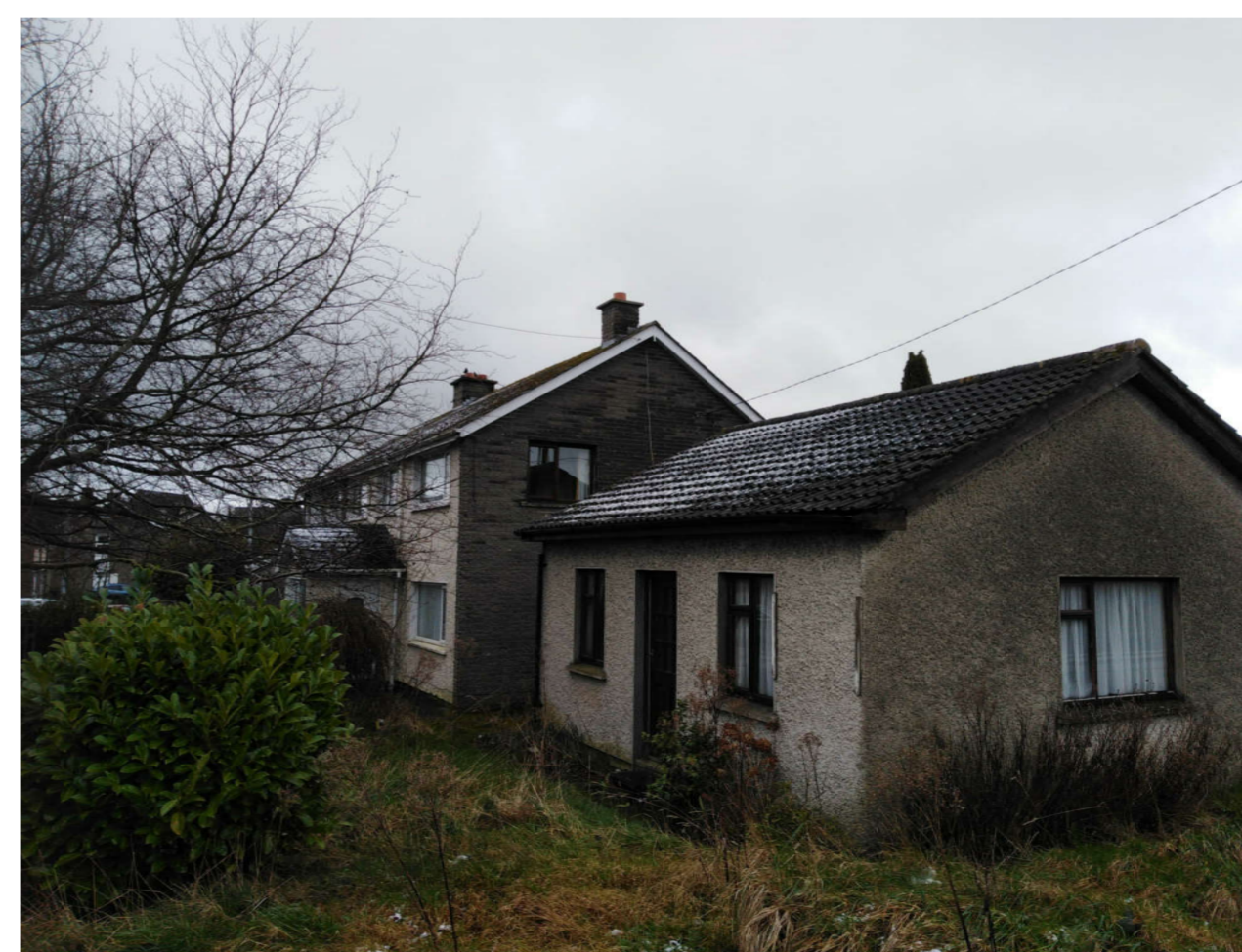
IMAGE 3. EXISTING SINGLE STOREY STRUCTURE TO BE DEMOLISHED